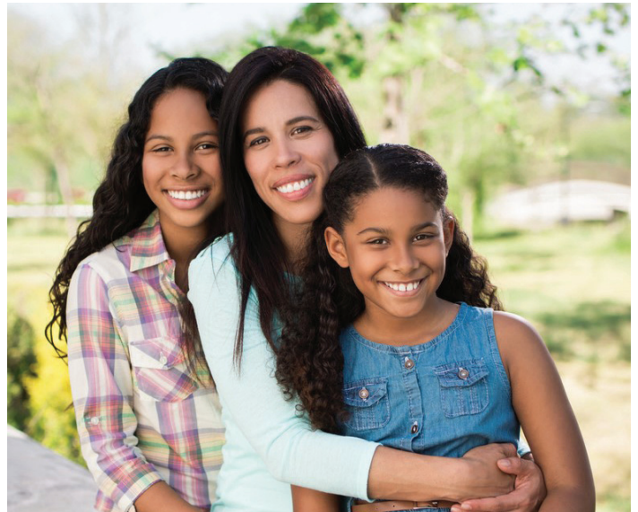
*name and image changed to protect privacy